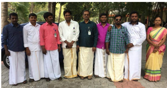
Pongal celebration on January 2017

We proudly framing our Chemistry Department continuous lively acts through various events organized from the past academic year. Our staffs uniquely play many remembrance activities in various occasions include curriculum event organizing, participating and maintaining the decorum of institute as well as department programme. Every year our institute was celebrating tamizhar festival “Pongal” that shows cultural unity and traditional congregation improving their strong relationship between staffs and student coordination.