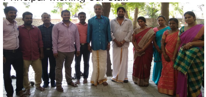
Principal with our Department staff on end of Pooja