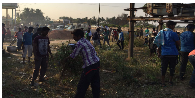
Students cleaning in rural areas