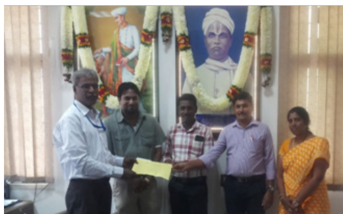
Inviting principal for Department speech competition