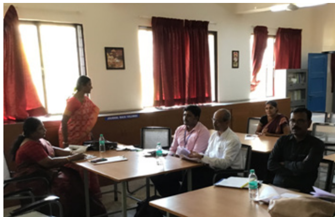
Curriculum base on revised syllabus meet in Anna Adharsh college

sonally care for arranging candidates to participate walkathon programme invited from the University of Madras on December 2019.