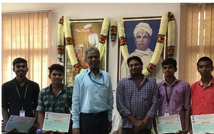
Students attended SSN College Tamil science conference

Even our first year candidates attended their national science conference (Tamil) was conducted in SSN College of arts and science giving one more source to updating their science skills interact with the eminent scientists who were presented there.