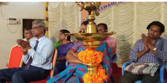
Department Heads welcoming first years