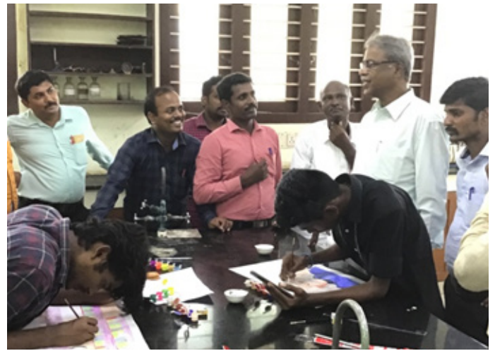
Principal revealing story behind every scientist