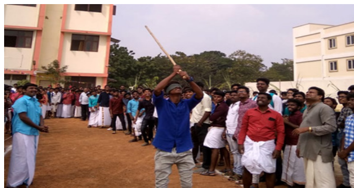
Department staff encouraging students