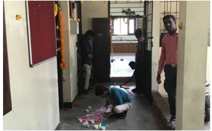
Student on pooja decoration

The spiritual respects in academic all department staff members and students voluntarily involved in cleaning, decorating and food sharing for the celebration of “Vijaya Dasami pooja” was conducted on 4th October 2019.