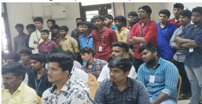
Students viewing speech competition