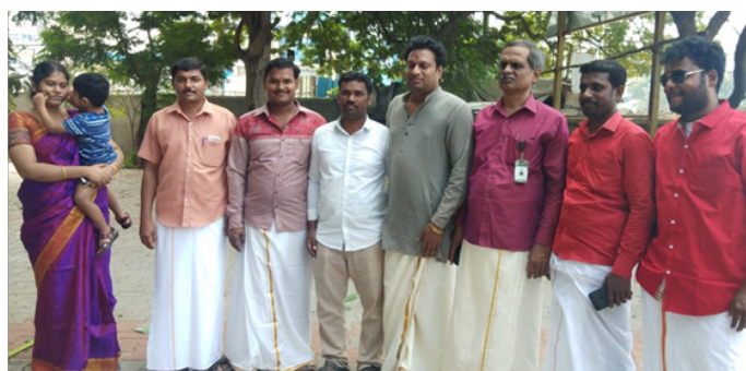
Pongal celebration on January 2018