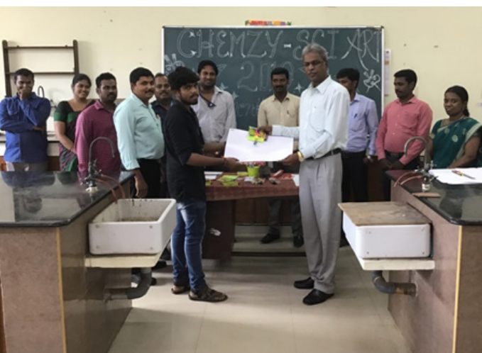
Principal inaugurating Chemzy Sci Art 19