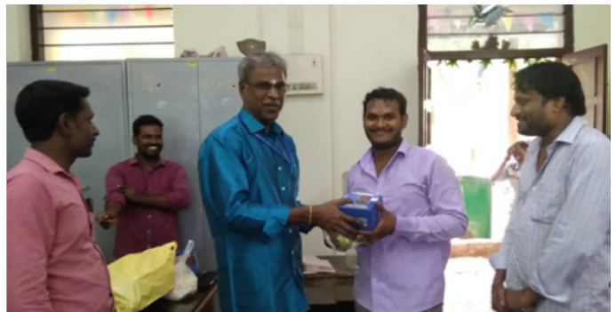
Principal wishing our staff