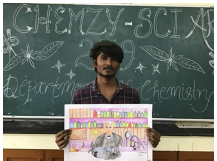
Candidate posting art work