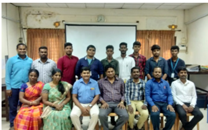
End of the program staff along with participants